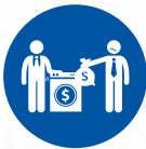
Illegal or fraudulent acts

We are asking you to join the fight against fraud today by reporting: